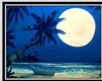
Moonlight Castaway 22x28