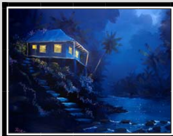
Lazy River 22x28