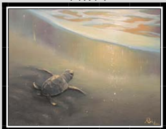
New Beginning 11x14